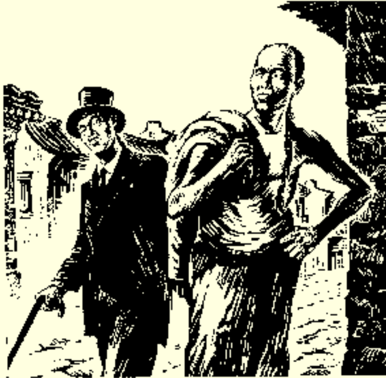
Now this "Imitation Foreign Devil" was approaching.

From the distance approached another of Ah Q's enemies. This was Mr. Chien's eldest son whom Ah Q also despised. After studying in a foreign school in the city, it seemed he had gone to Japan. When he came home half a year later his legs were straight and his pigtail had disappeared. His mother cried bitterly a dozen times, and his wife tried three times to jump into the well. Later his mother told everyone, "His pigtail was cut off by some scoundrel when he was drunk. He would have been able to be an official, but now he will have to wait until it has grown again before he thinks of that." Ah Q did not, however, believe this, and insisted on calling him "Imitation Foreign Devil" and "Traitor in Foreign Pay." As soon as Ah Q saw him he would start cursing under his breath.